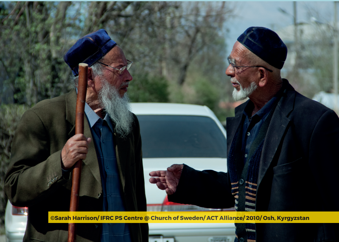
©Sarah Harrison/ IFRC PS Centre © Church of Sweden/ ACT Alliance/ 2010/ Osh, Kyrgyzstan

During quarantine, where possible, safe communication channels should be provided to reduce loneliness and psychological isolation (e.g. WeChat).